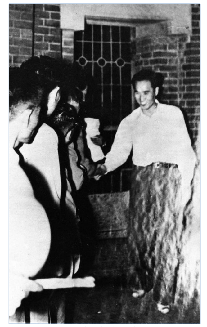
Father was acquitted and released from prison on October 4. Here, members welcome him back to freedom.

Therefore, the life I led in prison became the vertical foundation upon which to lay the individual foundation. In order to establish the vertical realm conveying God's heart in this hell on earth - based on the vertical love of God - I had to go to prison. From God's viewpoint this was the fastest way. I had to go into this situation and be victorious on the individual level. For me it was a fight between the physical body refusing to endure pain, and the mind. I needed to lead a life wherein I set my mind to the vertical standard and the body to the horizontal standard at right angles. In so doing, I had to give love. I had to love everything in that environment as I would my own brothers and sisters and stay imprisoned with members of the church family who represented God's desire for my own family. Therefore, instead of the parents, I needed to walk the path of the cross on the individual level. As an individual, I had to overcome the environment of the cross in my country.